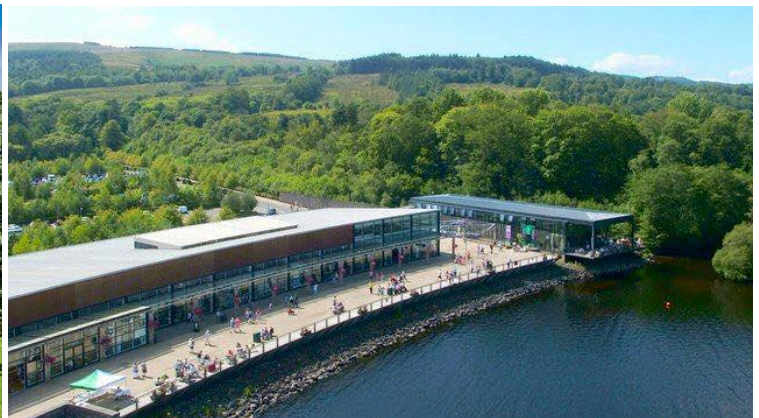
Balloch Park and Lomond Shores.