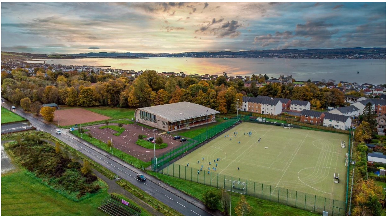
Our school benefits from access to fantastic facilities for sport and outdoor learning.