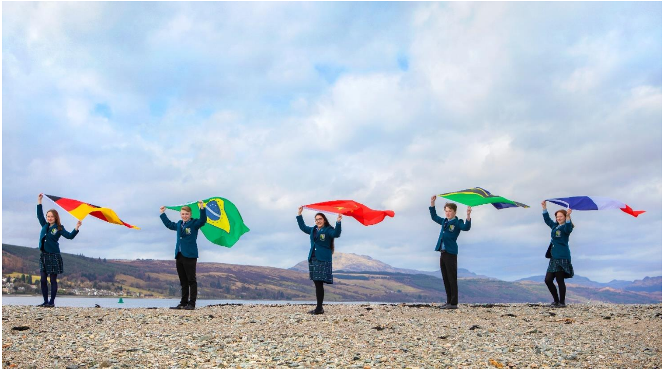
In August 2021 Lomond School launched the IB Diploma Programme and IB Career-related Programme for pupils entering S5.

In addition to our current SQA provision for pupils we have recently been authorised by the International Baccalaureate Organisation to offer both the IB Diploma Programme (IBDP) and the IB Careers Programme (IBCP). From August 2021, Lomond is the only school in the world to offer the IBDP and IBCP along with SQA National 5, Highers and Advanced Highers and an HNC in Business. Further information can be found on our website, www.lomondschool.com .