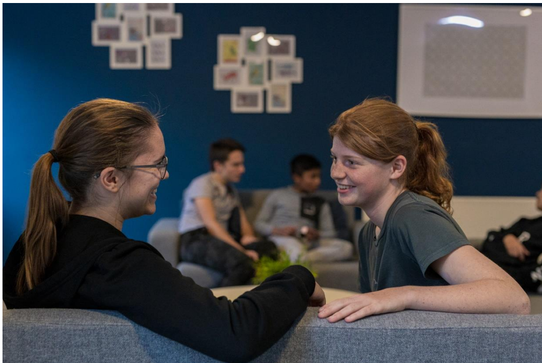
Burnbrae, Lomond School's Co-ed Boarding House is home to around 60 young people from the UK and around the world.