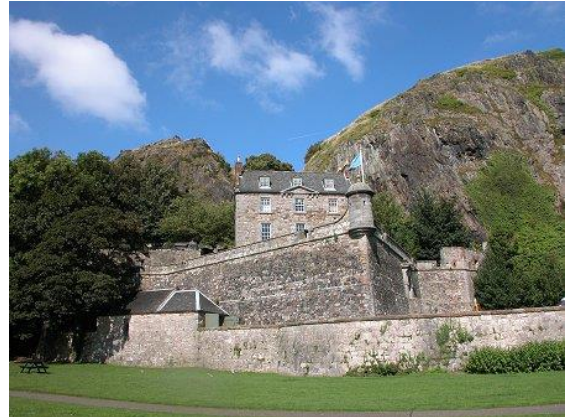
Cardross Golf Club and Dumbarton Castle.