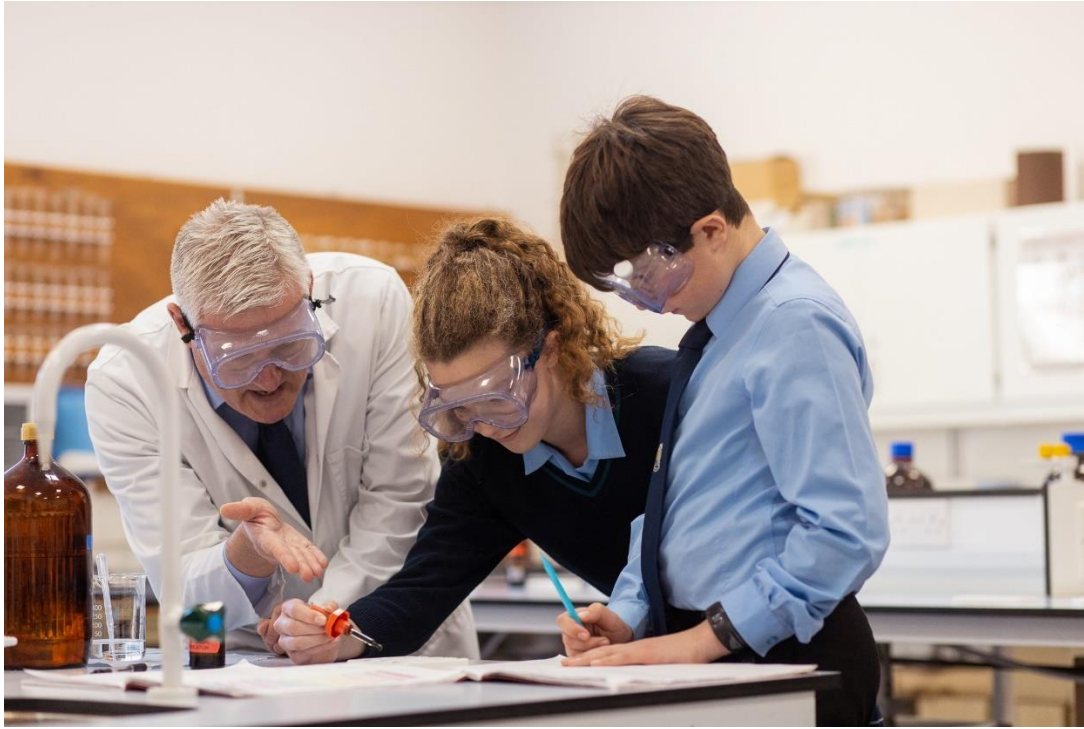
Our pupils thrive in our supportive and nurturing environment, where small classes mean every pupil is known.

Our academic results are consistently well above the National average and the majority of our young people will move beyond school and onto university courses, most receiving their first choice of destination. The school was inspected by Education Scotland in November 2015 and received a very strong report stating that 'at all stages of the school, children and young people are highly motivated and actively involved in their learning. They are respectful, hard-working and respond very well to the overall high-quality learning experiences.' The full report can be found here .